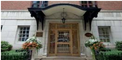
This bronze door, which is framed by a wrought-iron canopy and copper roof, offers entry to 33 E. Bellevue Pl.