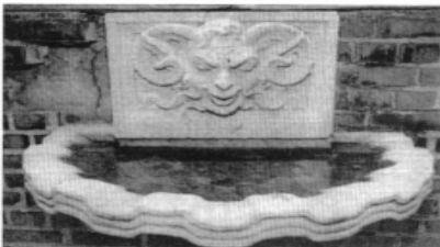
The courtyard fountain will be in working order when the renovation work is finished, according to developer Bruce Abrams.

mer houses"—in fact rambling mansions—in Lake Forest, she said.