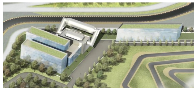
Research and Development Facility (Site 2)