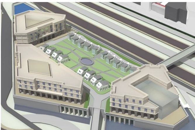
Luxury Hotel (Site 2)

The Master Plan Design of an exclusive auto racing enthusiasts membership club on a 1,200,000 sqm site in South Korea analyzed two potential sites located adjacent to Seoul's Incheon Airport in a designated Economic Free Enterprise Zone. Comprised of a fleet of exotic sports cars, a FIA Grade 1 Five km race track, luxury Hotel and Research and Design Center, the Club will become the hub for racing enthusiasts in Asia by providing a unique member's only exclusive driving and instructional experience. The project includes dedicated signature buildings for auto manufacturers providing direct access to the track and will feature showrooms, garage areas, retail and hospitality facilities.